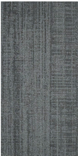
Urban Mix 03