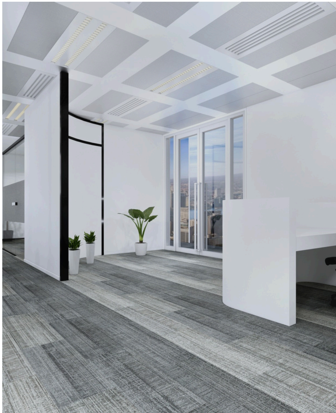
Urban Mix 02 Urban Mix 03