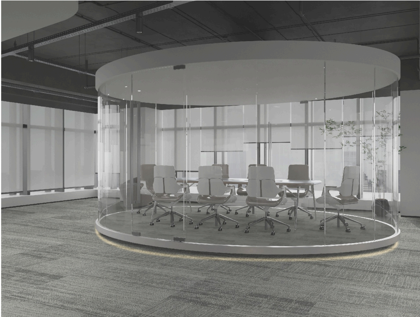
Urban Mix 02

Urban areas are the crystallization of human civilization, full of rich color, texture, and story. From old buildings to modern skyscrapers, from busy streets to quiet parks, every corner of the urban landscape contains endless design inspiration.