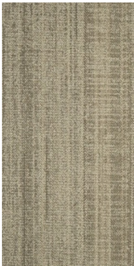
Urban Mix 01