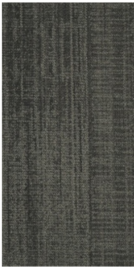
Urban Mix 04