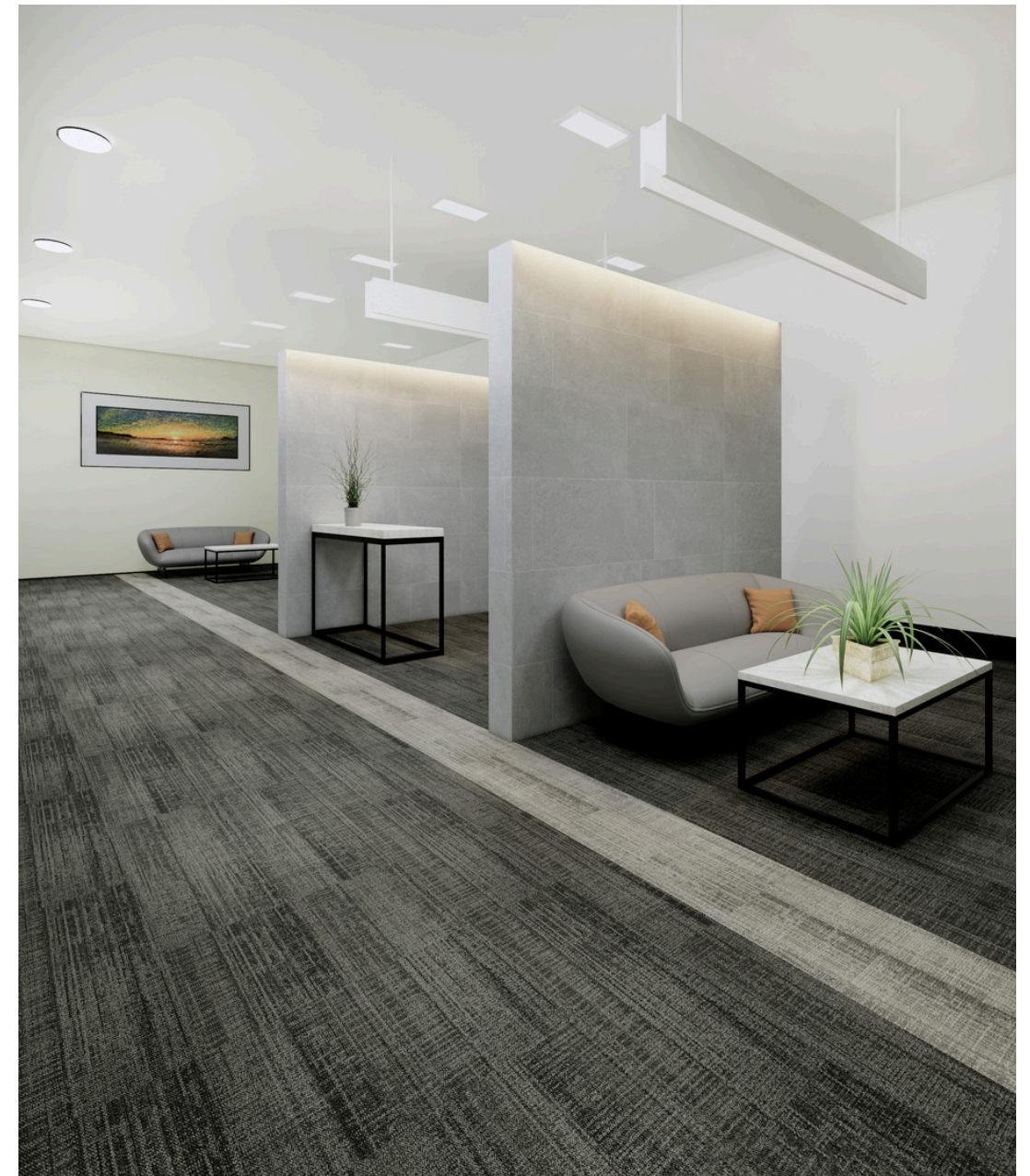
Urban Mix 04 & 05