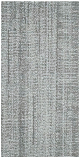
Urban Mix 02