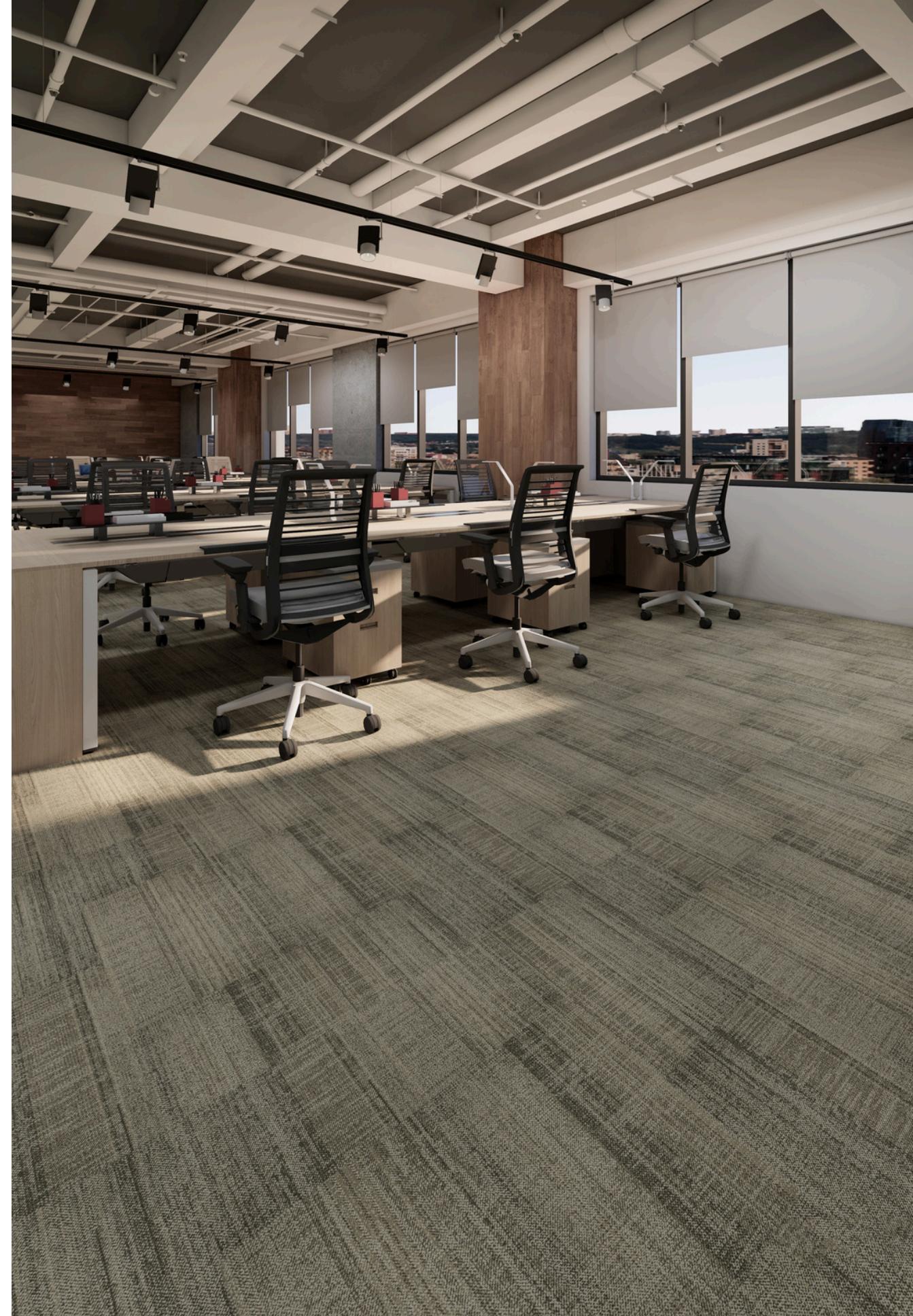
Urban Mix 01

The herringbone pattern in the Urban Mix series reflects the rhythm of architecture and the flow of urban life—bringing structure and movement to modern interiors.