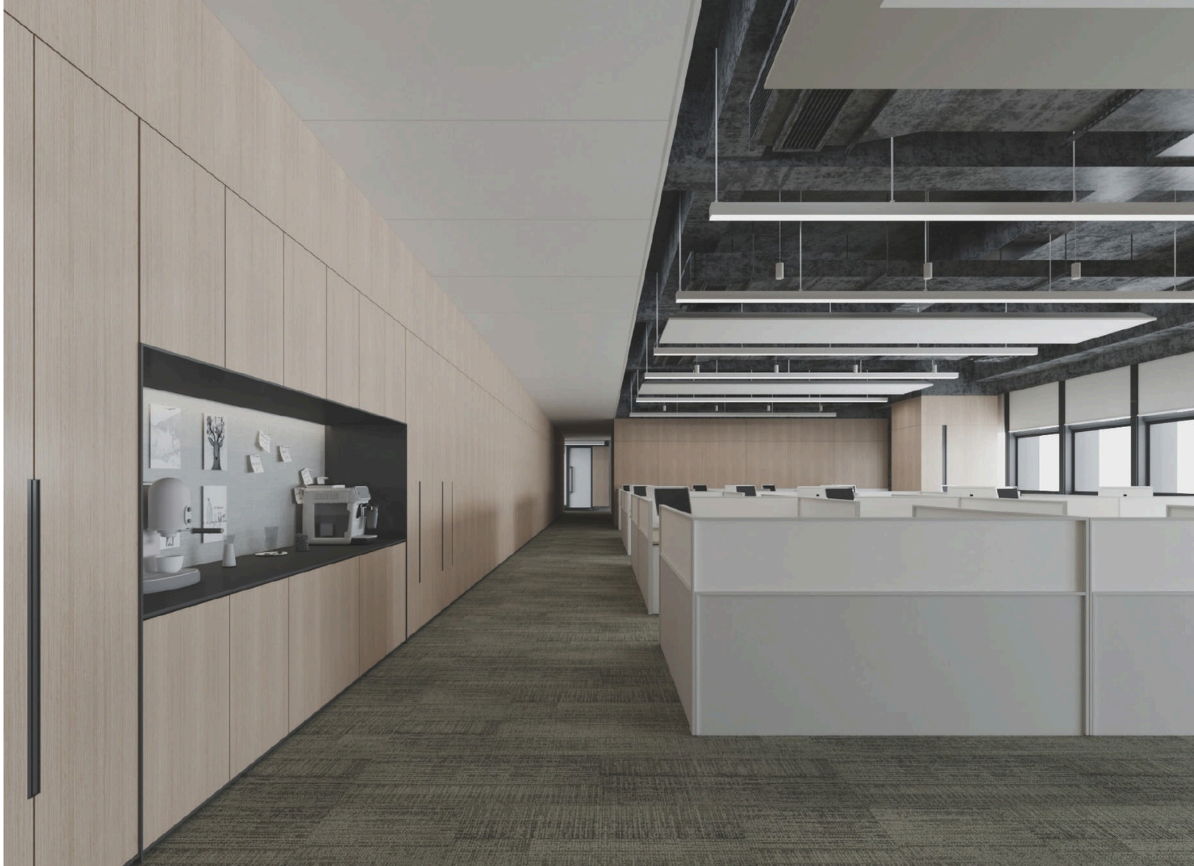
Urban Mix 03