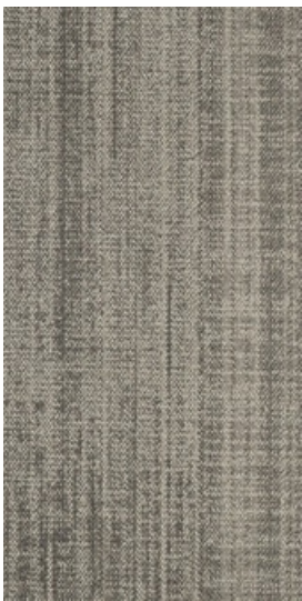
Urban Mix 05