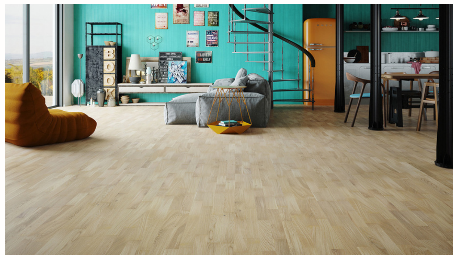
OAK BIANCA - 3 STRIP