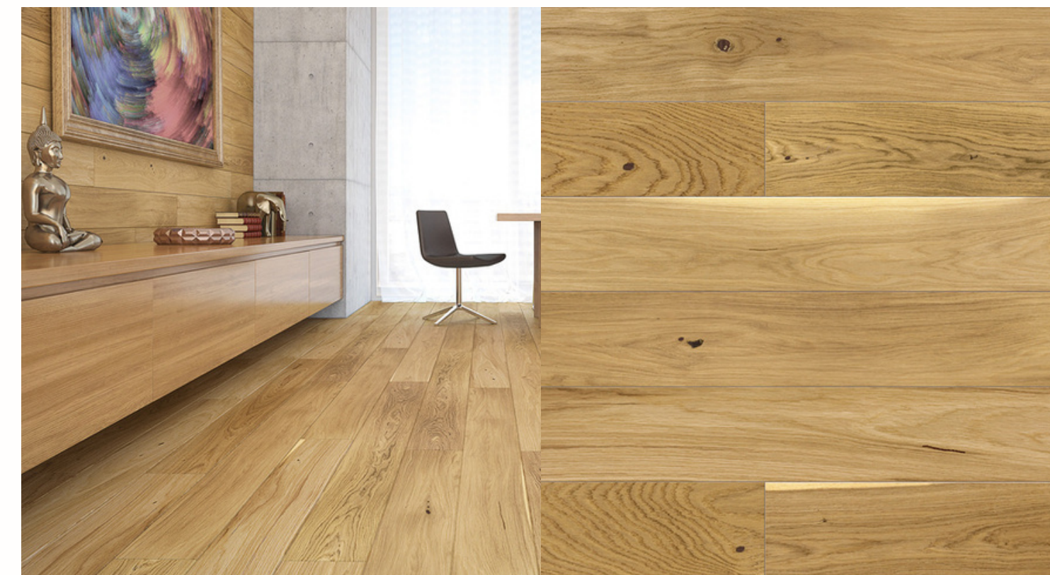
OAK AZURE WINDOW