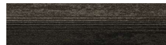
887 LRV: 2,97 - L 20,00