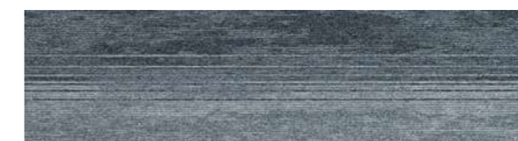
556 LRV: 11,63 - L 39,77