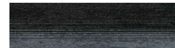
599 LRV: 3,03 - L 27,35