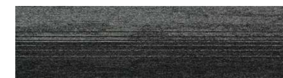
979 LRV: 4,79 - L 29,01

LRV = Light Reflectance Value according to BS 8493, L = according to CIE L*a*b* colour space