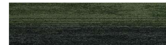
699 LRV: 3,14 - L 22,84