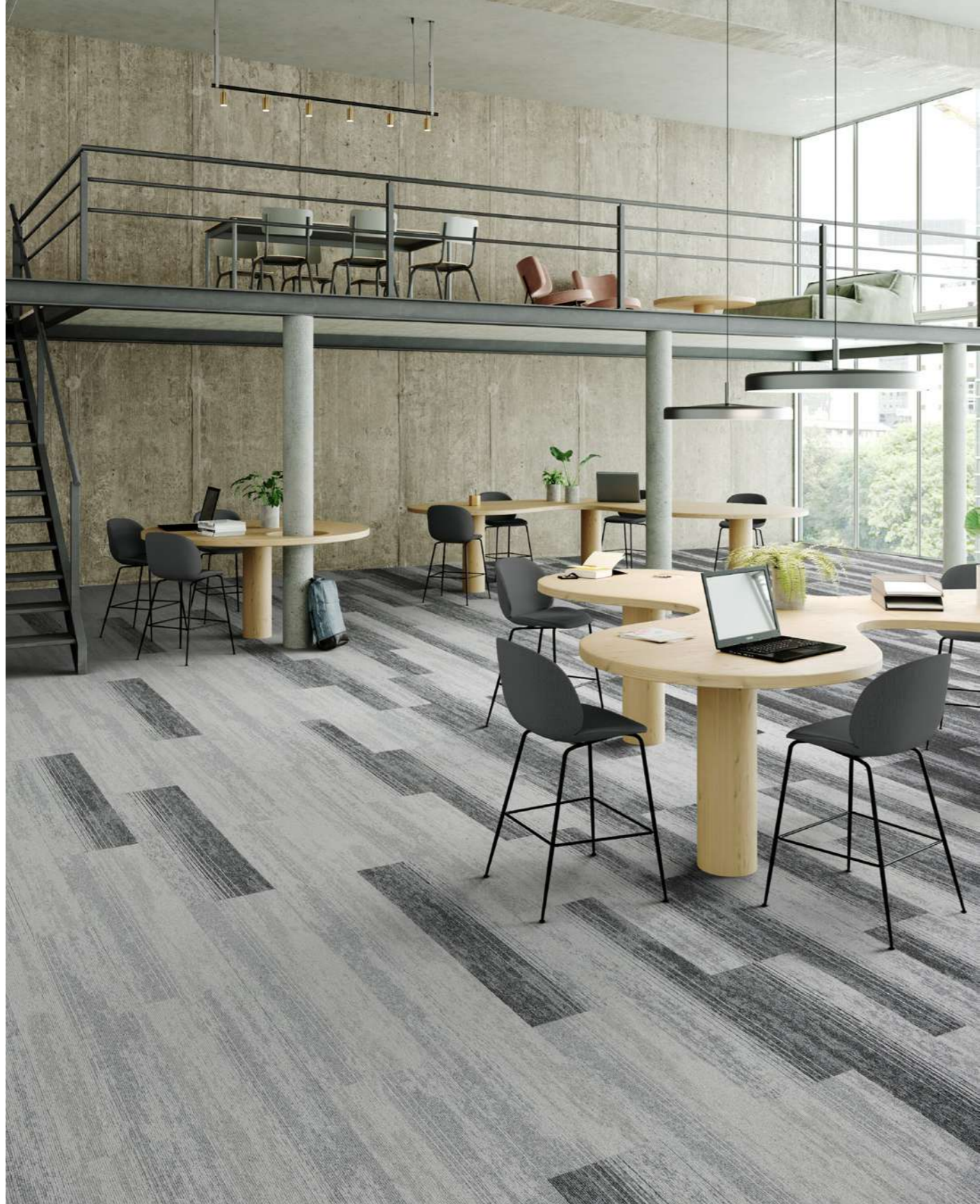
Clay Create 955 - 977 - 979