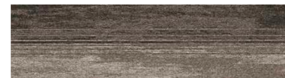
872 LRV: 12,76 - L 39,73