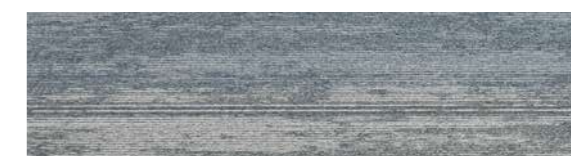
594 LRV: 16,70 - L 52,41