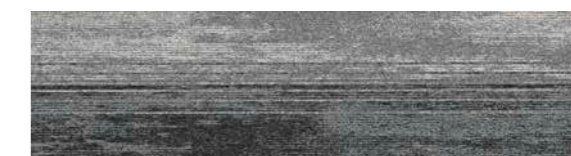
955 LRV: 10,18 - L 36,61