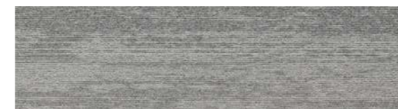
977 LRV: 23,40 - L 54,85